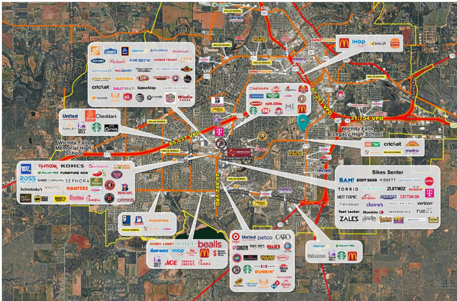
Aerial map used with permission from Lacy Beasley President of Retail Strategies

This versatile office space presents an outstanding investment opportunity. Contact us today for more details or to schedule a viewing.