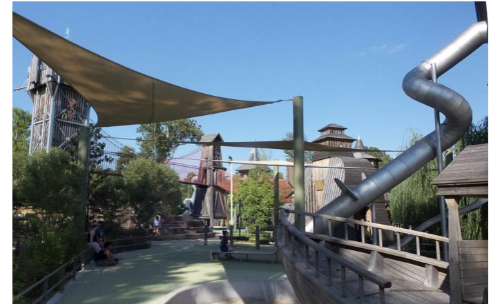
The Gathering Place